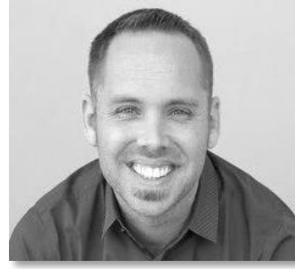
Todd, The United States