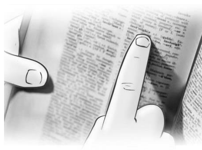
----- Read the definitions

II. Listen to this short biography of Jabbar Baghcheban, who is famously known as the Father of the Deaf in Iran. Then match the events on the left with the years on the right. ( 1 pt )