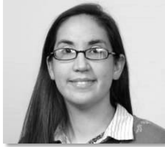
Meg, The United States

III. Meg and Todd are comparing their past life with their present life. Listen and check the correct answers. ( 1 pt )