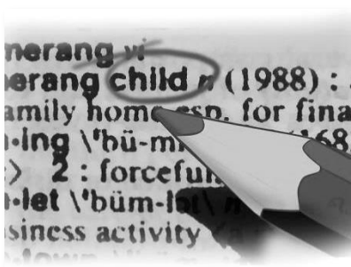
----- Look for collocations