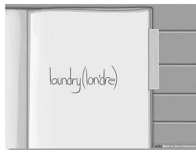
----- Learn the guide to pronunciation